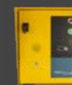
GST1 PLUS SERIE